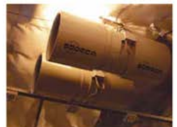
Tunnel Abu Dhabi, United Arab Emirates