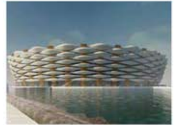
Basra Sports City, Iraq