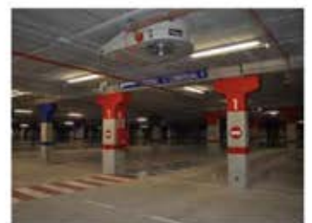
Centro Comercial Parque Ademuz, España