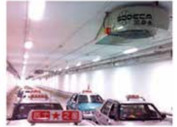
Tunnel Projects Shanghai, China

Examples of this include: Shanghai, "Shanghai Tunnel Projects"; Iraq, "Basra Sports City"; Romania, "National Theatre"; United Arab Emirates, "Abu Dhabi Tunnel"; and in Spain itself, "the Ademuz Park Shopping Centre".